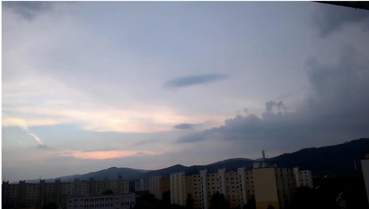
Storm in Zvolen from 2018